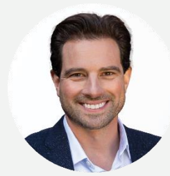
Scott McGillivray Real estate expert, contractor and media personality